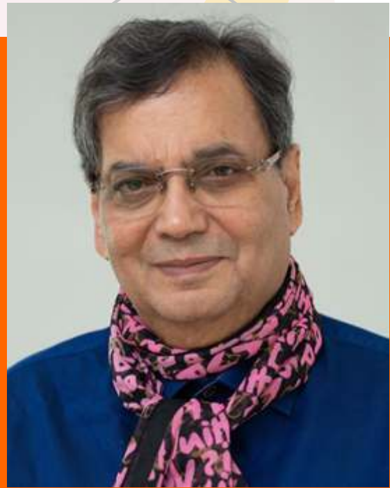
MR. SUBHASH GHAI

I congratulate MESC for taking forward the Recognition of Prior Learning RPL-4 initiative and helping the professionals and experts gain a well-deserved government-recognized certification, endorsing the passion, skills, and all the hard work they have put in towards the expansion of M&E Industry. I also would like to take this opportunity to congratulate all the RPL certified candidates and urge them to keep themselves constantly engaged in the industry as professionals and mentor to groom the new talent. I strongly believe the future of the entire M&E industry lies in the way we keep on skilling, upskilling, and reskilling our own self. Let the passion and dedication continue to make India the Skill Capital of the World